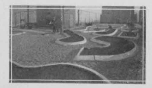
Shaw miniature course at St. Louis draws big play with its greens of grass texture