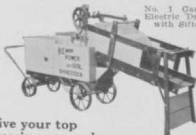
No. 1 Gas or Electric Driven with Sifter.