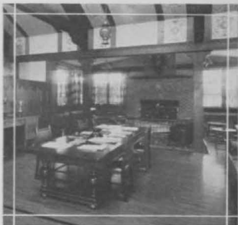
A view of the lounge alcove in the new Seattle G. C. locker-room

In the matter of showers, proper mixers are most important. See that the type installed is one that does not permit undesired spurts of boiling hot and ice-cold water during the shower. Take off the shower heads from time to time and