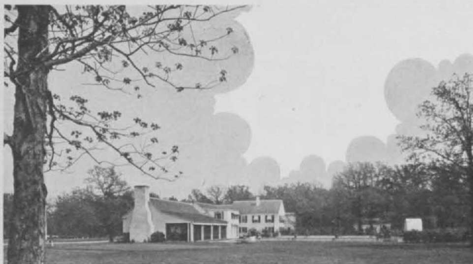
Here Is a Good Example of Remodeling an Existing Building Into One Suitable for Clubhouse Use. Wings Have Been Built on the Original Structure Without Destroying Unity. Knollwood Country Club, Lake Forest, Ill.