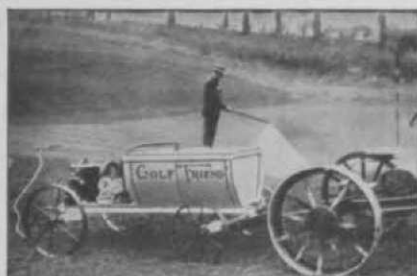
One of the smaller machines at work.