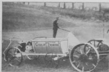
One of the smaller machines at work.