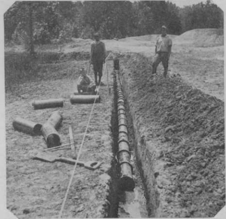
This drainage line, on the tenth hole, relieves the fairway of seepages along the hard-pan outcrops

Incidentally, my observation has been that the best architect can make only an