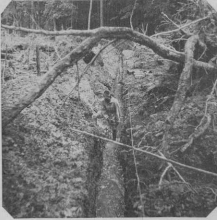
The swampy character of the second fairway is indicated by the free-running water in the ditch previous to tiling

In this ditch No. 2 grade of regular hard-burned clay sewer pipe was laid, the bells or sockets being left open to admit the water but serving to hold the pipe in alignment. At the center of this line, or the lowest point, another line of underground pipe was connected, and continued at right angles with the first line, directly