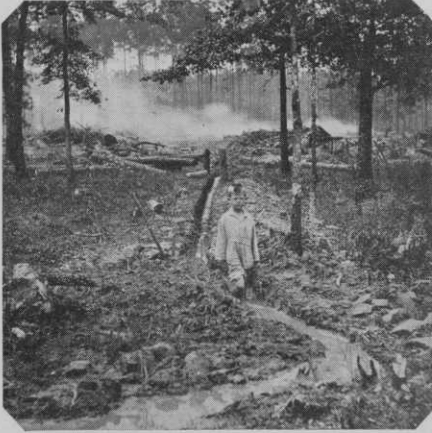
One of the outlets, showing the amount of water the tile lines will accommodate

In other words, evolution in the drainage system is costly and expensive, as it is