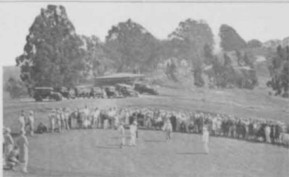
Greens At Lake Chabot Municipal Course Are Big and Are Kept in Good Shape.

THOSE responsible for the maintenance of private golf courses may think often that they have about all the burden that can be handled by greenkeepers or green-chairmen, but until they compare notes with the men in charge of municipal golf courses, they really haven't qualified for fair standing as first reader students of misery.