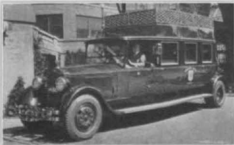
WHITE MOTOR COACH, KIMBALL BODY, IN EXCELLENT CONDITION, WHICH IS SPECIALLY SUITED TO GOLF OR COUNTRY CLUB USE AND ACCOMMODATES 20 PASSENGERS