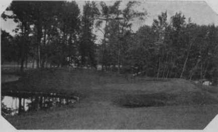
Seventh green shows woods and water combination that many say is brown-patch invitation

what brand he should use, but to state here what has been successful with me, and with a minimum of cost, the greatest cost being labor.