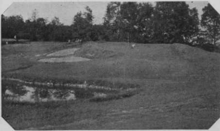
Third green at Glen Oaks. Interesting layout, and lots of work supplied for green-staff

When I feel the weather about right for brown-patch, viz., hot, sultry days and