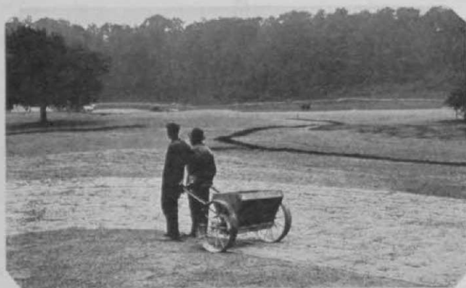
Spreading the arsenate and sand mixture on a green prior to scratching it into the top half inch of the soil.

Don't resort to such childish tactics. If you find yourself running short of arsenate of lead before you have finished applying it all over the green, mix up some more and finish the job properly. Incidentally this will save me the necessity of answering a