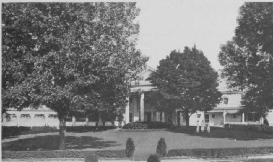
Minikahda's Stately Clubhouse Shows Character of the Club.