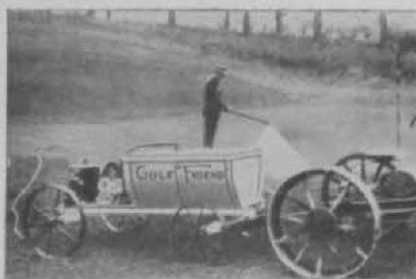
One of the smaller machines at work.

"In my buying here, I first want to know all about the equipment being sold. Then, I try to reason it out and find the good qualities and bad of said machine. If there are enough good qualities to make it worth while on a golf course, I then figure the price and if I can get the right amount of value out of it, I may purchase. If it is something new on the market, I must be shown where it is superior to the old in doing the same work and whether it will do it cheaper. Considering the money in-