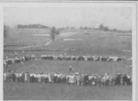
The 18th Green at Oakmont Country Club where U.S. G. A. open Championship was held. Stumpp & Walter Co.'s Grass Seeds used for many years.