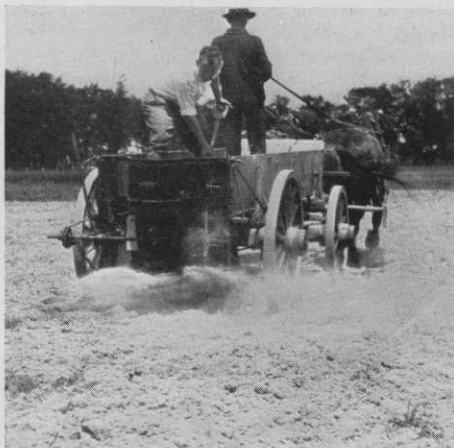
The endgate type spreader, attached to rear of wagon box. Fertilizer is fed into the hopper by shovel or poured from bags, and spreads by the machine in a fifteen-foot strip.

Based on composition a fertilizer high in nitrogen and potash seems best, but the plant food content of the soil, and the rate at which insoluble plant food becomes