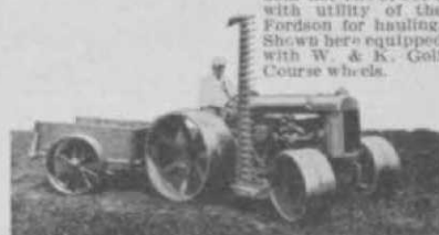
Detroit Rough Cutter when not in use does not interfere with utility of the Fordson for hauling. Shown here equipped with W. & K. Golf Course wheels.