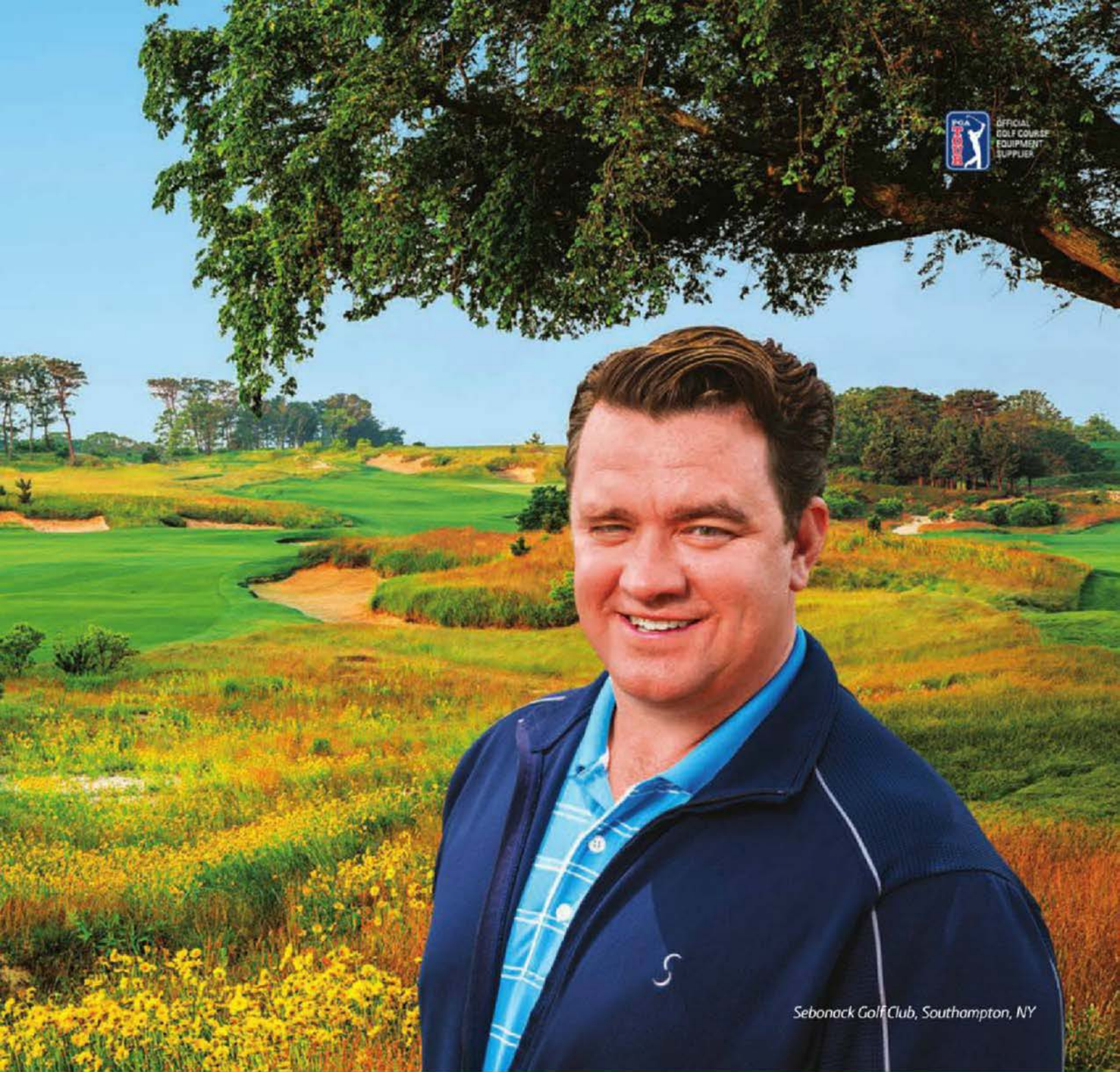
Sebonack Golf Club, Southampton, NY