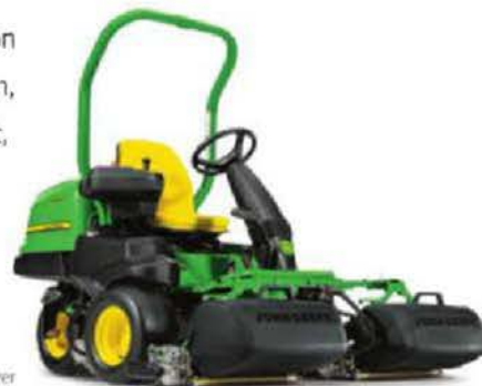
2500E-Cut™ Hybrid Greens Mower