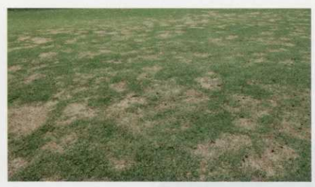
Symptoms of SDS are fairly diagnostic - patches from 6 inches up to 18 inches, or even several feet in diameter are present at spring green-up.

ies with improved cold tolerance are more resistant to SDS. Guymon, Midlawn, Midfield, Midiron, Yukon, Mirage and Sundevil have been shown to have improved resistance to SDS, whereas Arizona Common, Chevenne, Jackpot, NuMex Sahara, Oasis, Poco Verde, Primavera, Princess, Sonesta, Shanghai, Tifton 10, Tifway, Tifgreen, Tropica, Vamont and Sunturf are all susceptible to SDS.