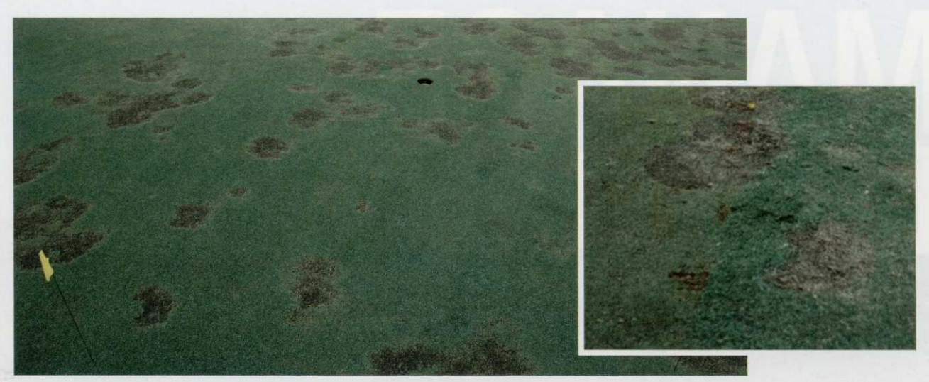
Spring dead spot is most common in the transition zone where Bermudagrass is grown and subjected to periods of cold temperatures that induce plant dormancy.

ments where Bermudagrass tends to go semi- to completely dormant, Martin says. In areas where winters are cold enough for Bermuda to go completely dormant, SDS tends to be more severe than in climates with warmer winters.