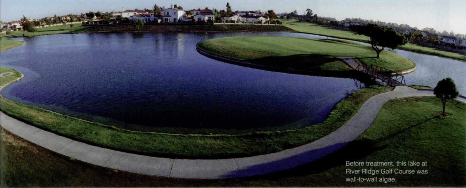
Before treatment, this lake at River Ridge Golf Course was wall-to-wall algae.

“It’s important to mix the water so there isn’t a layering of temps,” says Kanny. “This can be accomplished with fountains and aeration bubblers.”