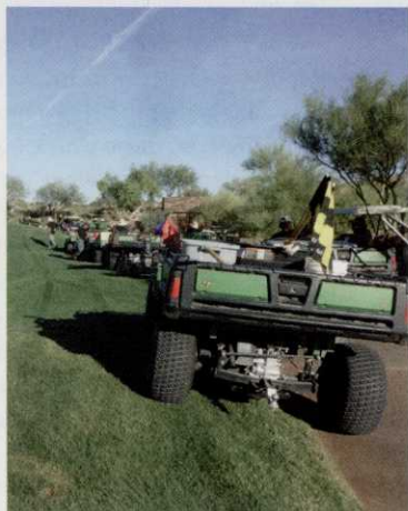
Desert Mountain in Scottsdale, Ariz., The Cochise Course.