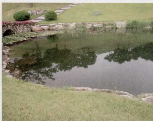
A golf course pond before and after treatment with Aqua-T