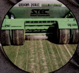
Ground Quake Sand Injector