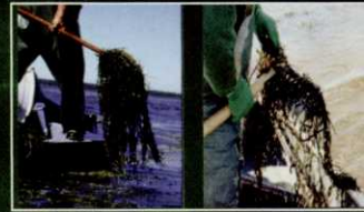
Harvesting Ascophyllum Nodosum in the Bay of Fundy

Country Club MD contains both Sea Plant Kelp Meal and Humic Acid which helps the turf grass plant achieve optimum performance by helping it prepare for the onset of stressful conditions. Turf treated with Sea Plant Kelp Meal and Humic Acid will outperform untreated turf in overall quality and playability during stressful conditions.