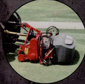
Turf Surgeon Verticuts and Collects