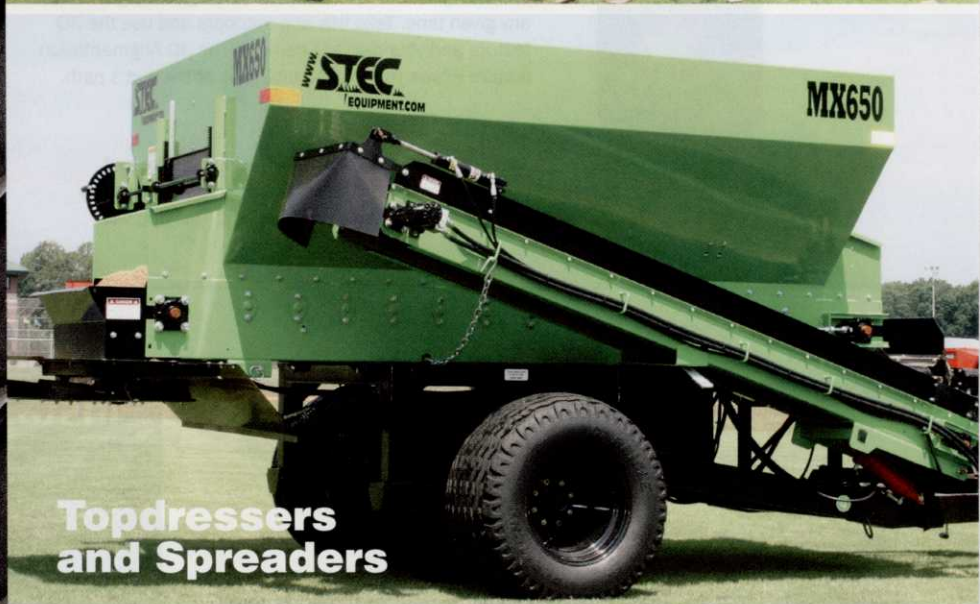
Topdressers and Spreaders