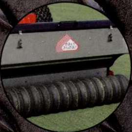
Precision Seeding Technology