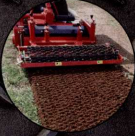
RotaDairon™ Soil Renovator