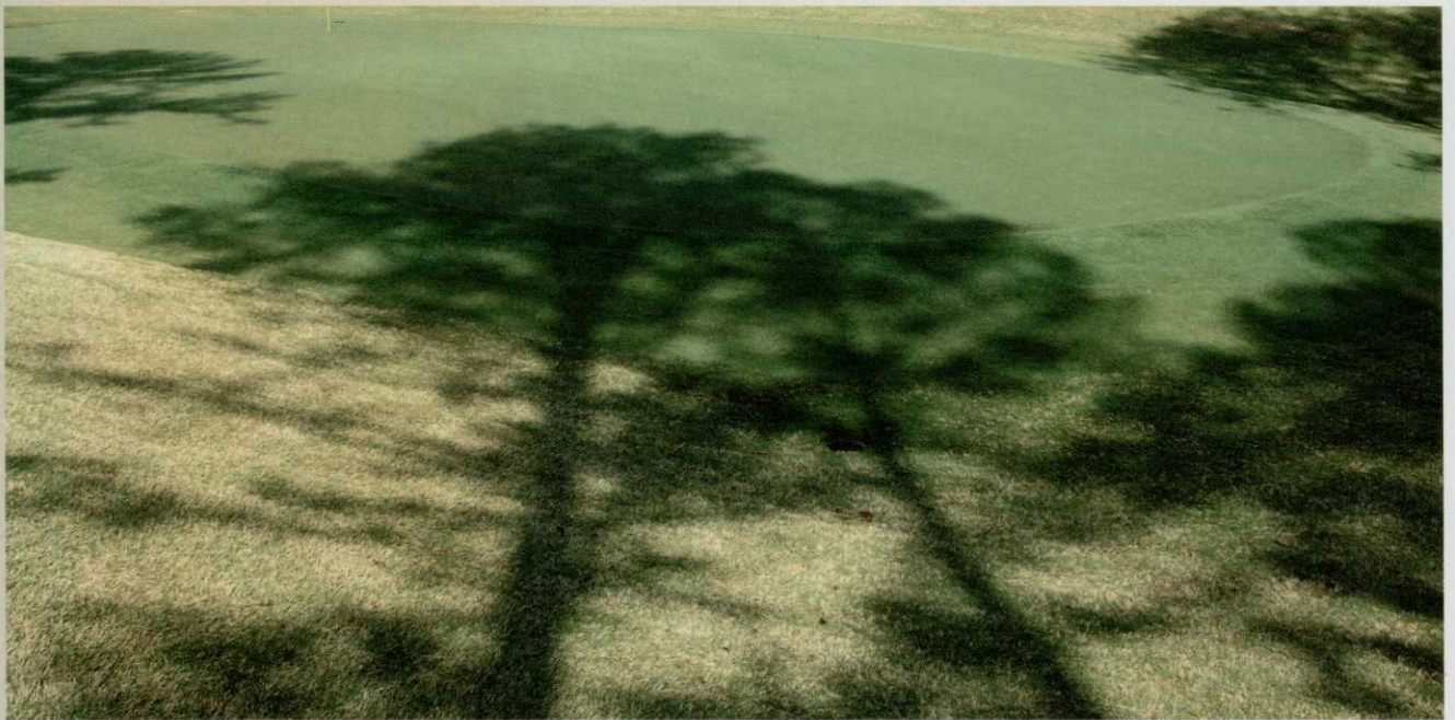
Shade from trees surrounding a putting green vary throughout the year due to the changing angle of the sun. The quantity of light for plant growth not only changes based upon shade, but on the time of day.

to measure PAR over the course of an entire day is needed rather than a method to measure PAR at any given moment.