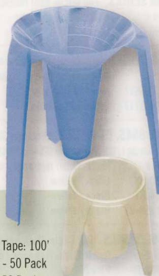
CatchCan Pro (CCPK-10) for LARGE TURF audits. Measures ml, cm, inches.