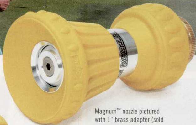
Magnum™ nozzle pictured with 1" brass adapter (sold separately on Page 4)