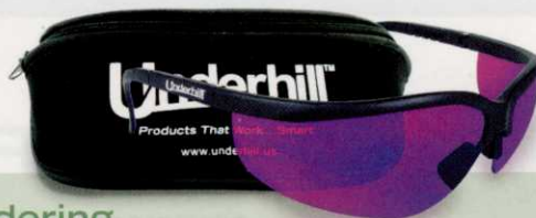
superior weed location and spraying saves time and money