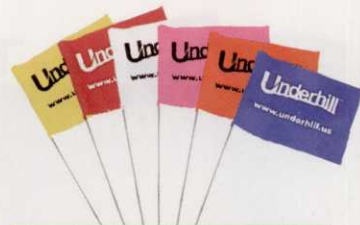
4" x 5" Marking flags on 21" wire (50-pack) are available in 6 colors.

Increasing watering times to compensate for poorly performing sprinklers wastes a lot of water. Accurately measuring sprinkler application rates with Underhill™ AuditMaster™ helps maximize water savings.