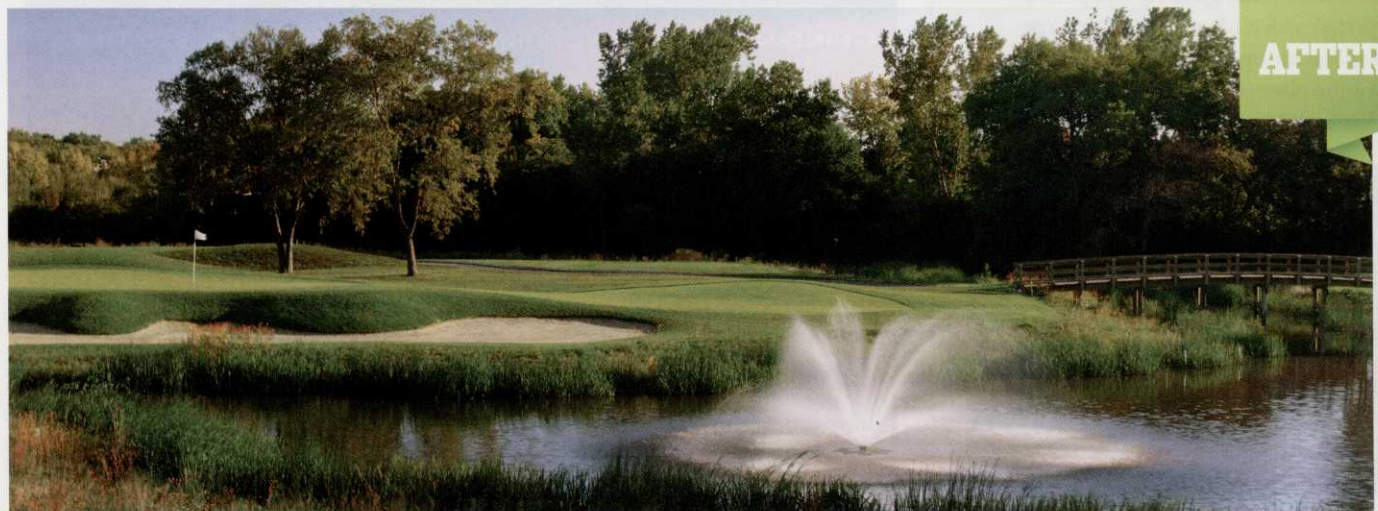
Sometimes being aware of water management means equipping the course to handle too much water.

district goals were not served by the project. In addition, maintenance costs at The Bridges are already trending down: less maintained acreage; no more clean-up costs related to regular stormwater damage and better course revenues. The flooding used to be so bad, the course had to be closed for days at a time; Poplar Creek had a reputation as a place that was always soggy, which further eroded rounds.