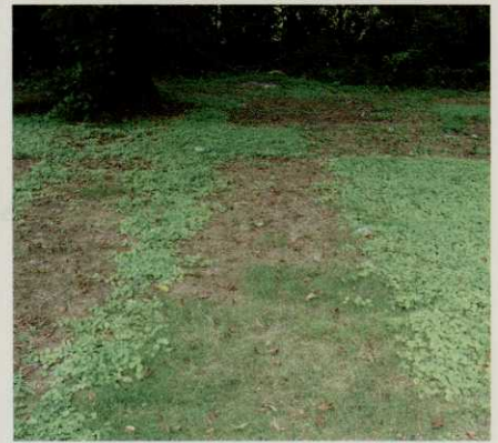
These two photos illustrate how Blindside controls buttonweed at 6.5 oz./acre. Photos were taken at the University of Tennessee 28 days after treatment.