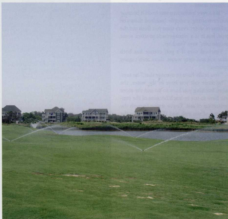
Salinity has become a bigger issue on golf courses as the use of reclaimed water rises, as well as a greater number of courses built along coasts or on wetlands.

Products aside, one golf course Vinchesi