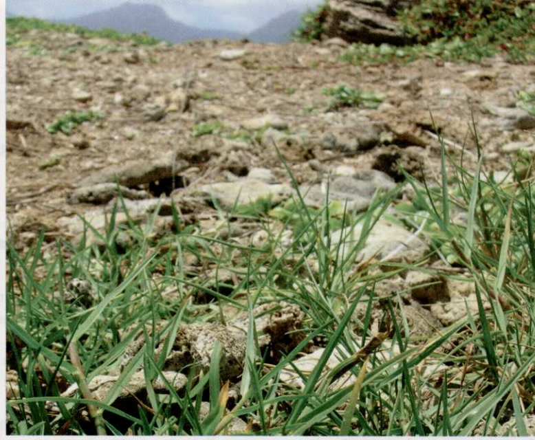
Seashore Paspalum is one of many tools for dealing with very salty soil.

Jason Stahl is a Cleveland, Ohio-based freelance writer and a frequent GCI contributor.