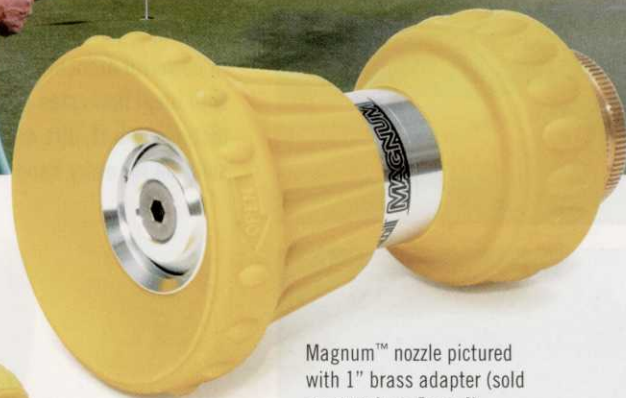
Magnum™ nozzle pictured with 1" brass adapter (sold separately on Page 4)