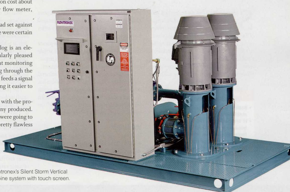
Flowtronex's Silent Storm Vertical Turbine system with touch screen.

Alyse Lamparyk is a freelance writer based in Athens, Ohio.