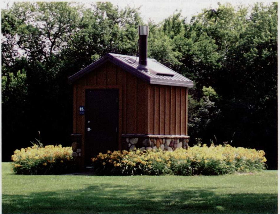
The Biological Mediation Systems facility composts without water or electricity and operates a ventilation fan via a solar power unit on the roof.

Brae Loch is much smaller than Countryside and its restrooms are more accessible, making it easier for the waste management