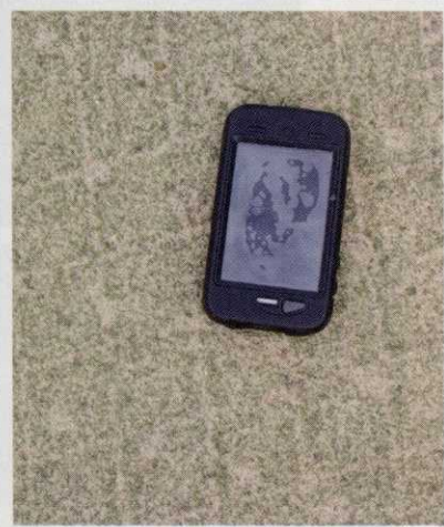
The greens drainage installation project underway at North Shore Country Club.