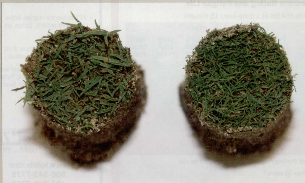
'L-93' creeping bentgrass (left) had coarser leaf texture and lower turf density than 'Vesper' velvet bentgrass (right) when maintained as putting greens in Madison, Wis.

Water restrictions are the up-and-coming bane of golf course management in many areas of the country and are no longer restricted to the South. It's becoming an accepted fact that many golf courses may have to cut back their use of potable water due