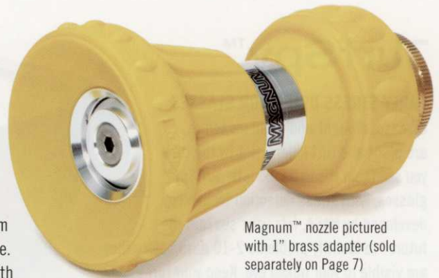
Magnum™ nozzle pictured with 1" brass adapter (sold separately on Page 7)