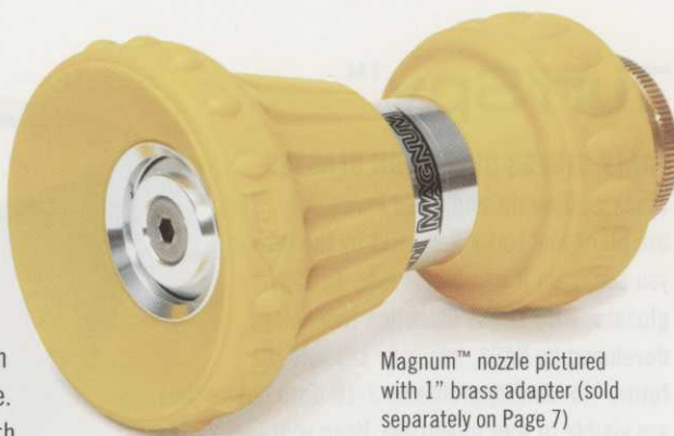
Magnum™ nozzle pictured with 1" brass adapter (sold separately on Page 7)

Underhill™ Magnum™ contains no plastic internal parts to break, stick or wear out. Our unique ratchet mechanism easily adjusts from gentle fan to powerful jet stream and prevents over-tightening damage. Precision-machined, incredibly smooth operation and outstanding distribution patterns make it ideal for high-demand areas like greens and tees. Magnum™ is also an excellent equipment wash-down nozzle.