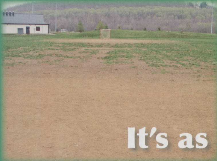
Meadowood Field II 4-14-06

• CLEANSE SOIL IMPURITIES • RESTORE MICROBIAL BALANCE • NATURAL DISEASE SUPPRESSION • ACTIVATED NUTRIENT DELIVERY