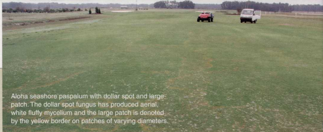
Aloha seashore paspalum with dollar spot and large patch. The dollar spot fungus has produced aerial, white fluffy mycelium and the large patch is denoted by the yellow border on patches of varying diameters.

“The reasons for problems was that applica-