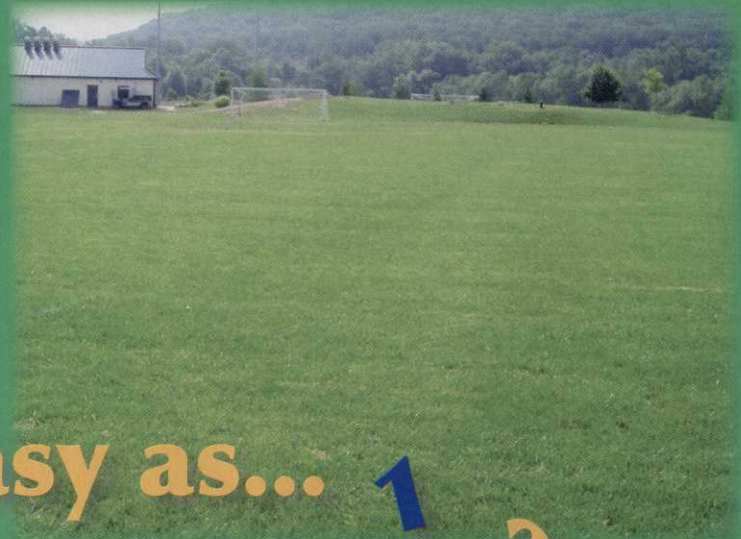
Meadowood Field II 8-22-07