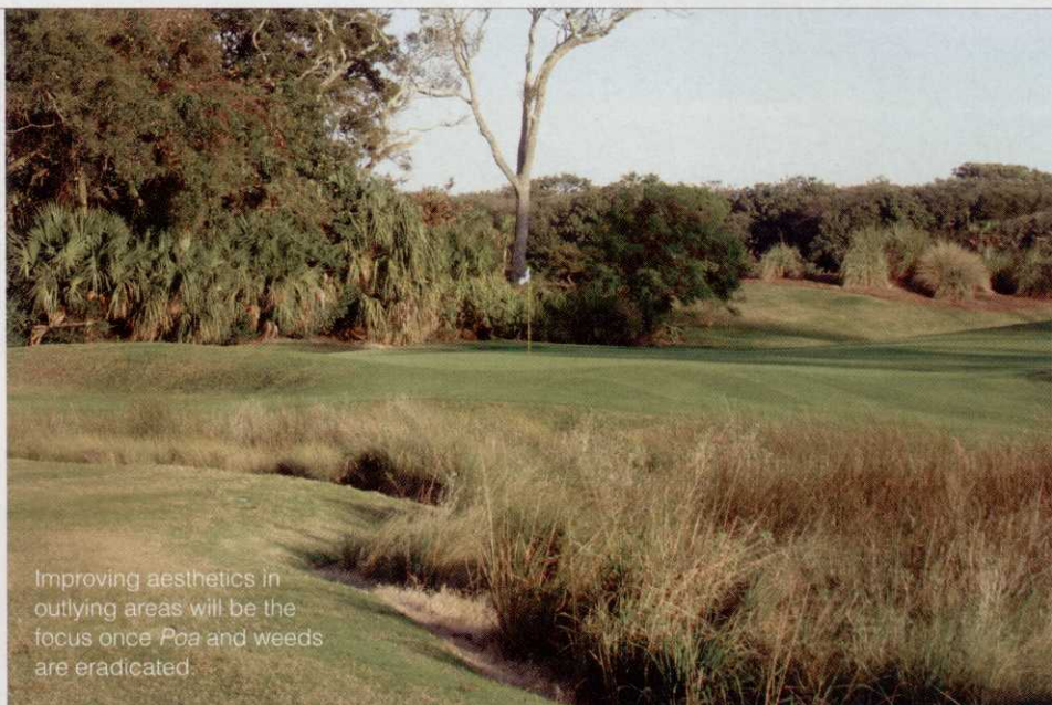
Improving aesthetics in outlying areas will be the focus once Poa and weeds are eradicated.

“Anytime you walk into a golf operation that existed for two or three decades, you’ll run into a lot of cobwebs,” Kyle says. “There was Poa annua and other weeds that were problems, along with the density of the bermudagrass base. Our goal was to improve conditions and eradicate weeds. Right now, we’re focused on the playing surface. Eventually, we’ll move toward outlying