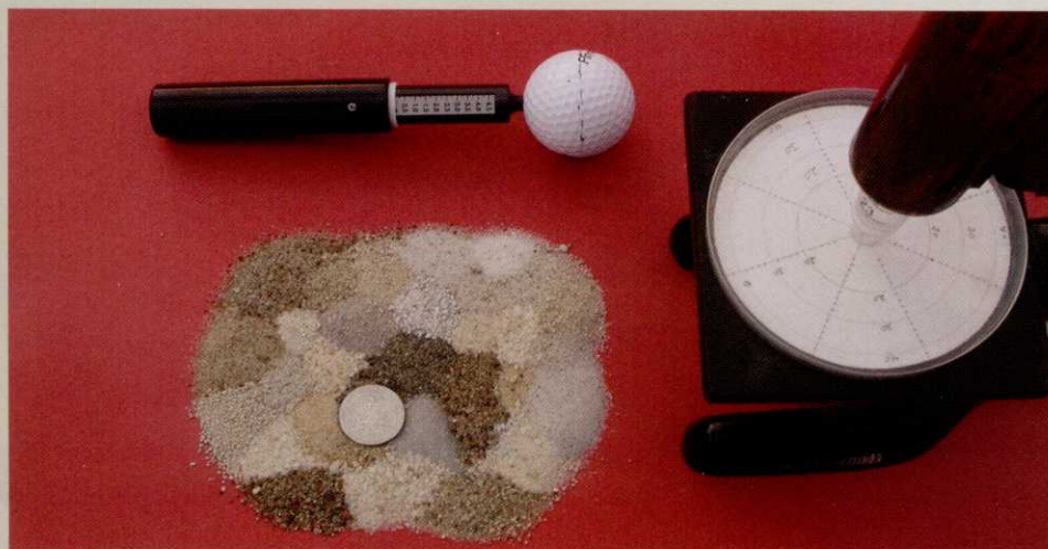
The sands analyzed in the study were variable in terms of all properties measured: particle size distribution, angularity, angle of repose, color and particle shape.

As an example of the variability present in these sand properties, one of the crushed sand products had the highest penetrometer value, 3.31, but also possessed a coefficient of uniformity and gradation index value of 1.86 and 3.53, respectively. If one were to characterize this sand based solely on the coefficient of uniformity or gradation index data, they would predict this sand is less likely to pack because the coefficient of uniformity is less than 2.0 and that its surface instability is barely “acceptable” because of the gradation index value falling barely inside the 3 to 6 “suggested” range. Based on this information, it’s apparent many properties likely influence sand surface hardness. These properties include particle size distribution, particle shape and other less quantifiable characteristics such