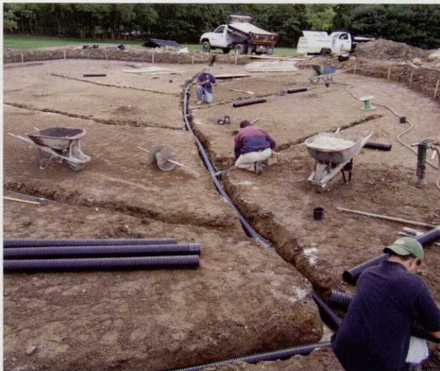
The golf course at Rockrimmon has been through every phase of construction during the past 14 years, from rebuilding greens to USGA specs to improving internal drainage on existing native soil pushup greens (below).