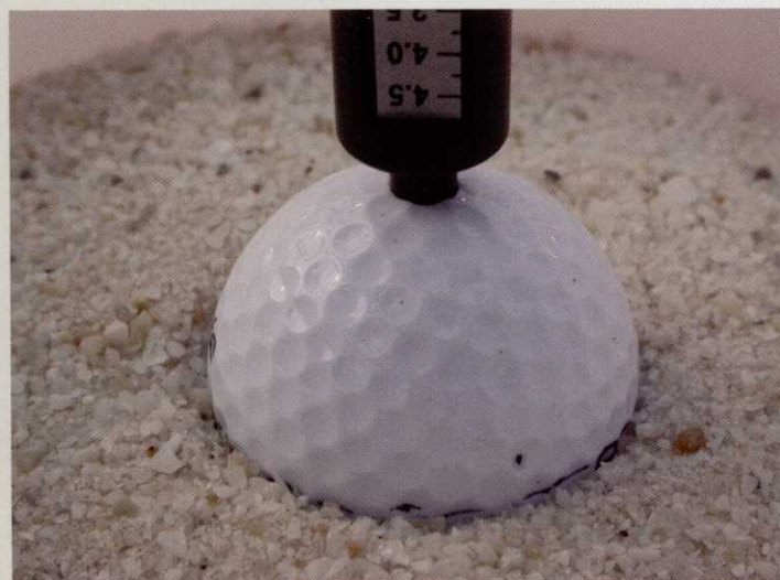
The data most helpful for determining surface hardness is the modified pocket penetrometer test.

One additional measurement that might help laboratories predict sand firmness is the angle of repose (Table 2). This calculation, expressed in