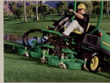
Hills, meet GRIP AWD.