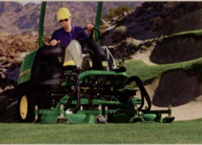
A wide-open wonder.