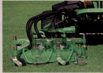
68" to 74". Right from your seat.