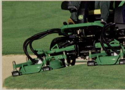
The reach to give you an edge.