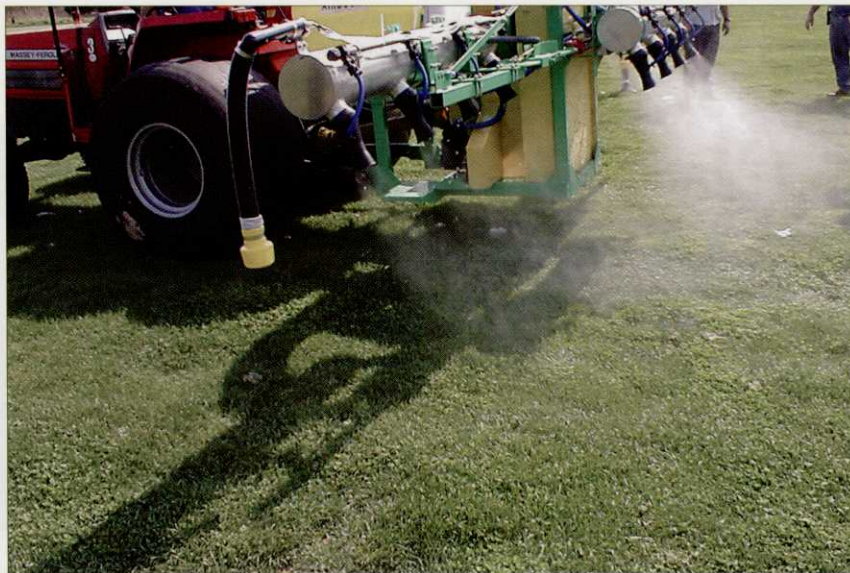
The Wintergreen crews don’t spray the fairways as much as they used to partly because zoysiagrass replaced bentgrass on nine holes.

Biggers is fascinated by the technology behind his Airtec sprayer, which deploys electrostatically charged particles into the air at high