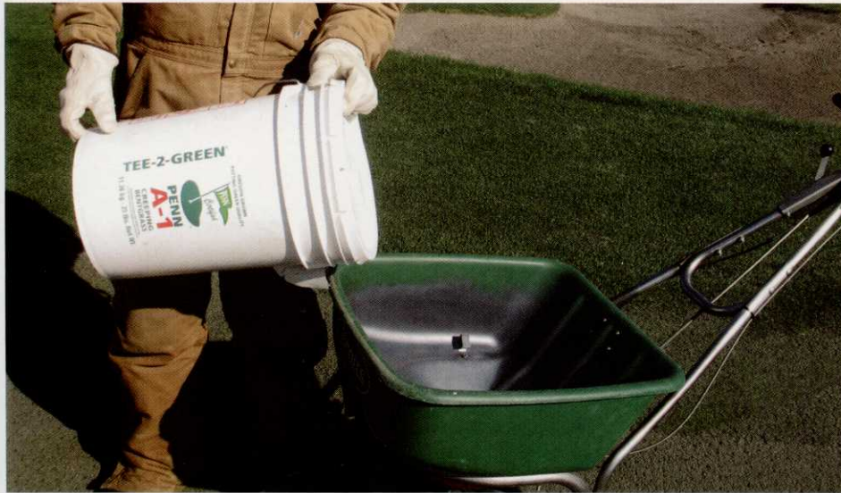
Phipps and Turley spread 1/4 to 1/3 of a pound of bentgrass seed per 1,000 square feet after aerifying and verticutting.