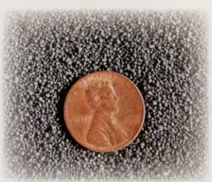
The extremely fine particles of Reservoir DG allow application to greens without interfering with play.