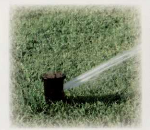
New Reservoir 50 is designed for easy injection into irrigation systems.

Save water and money! Use Reservoir 50 or Reservoir DG. For more information, contact your local Helena representative.