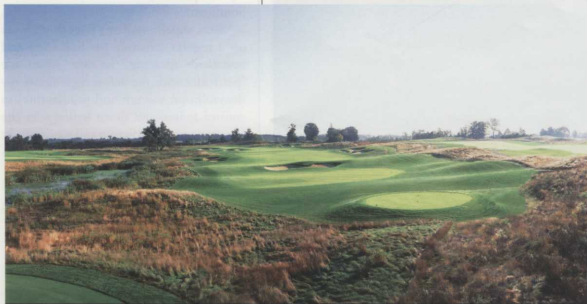
Crabgrass, dandelions and clover are some of the pests in the fescue and bluegrass roughs on two of the three golf courses at Turning Stone Casino Resort in New York.

Knappenberger, superintendent of Turning Stone Casino Resort's three 18-hole golf courses in Oneida, N.Y. "Later in the