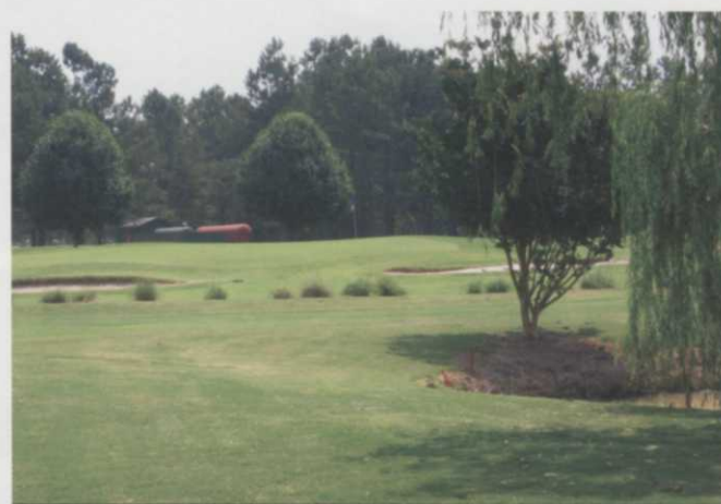
Charwood Country Club is run well because of its owner and director of golf/operations.