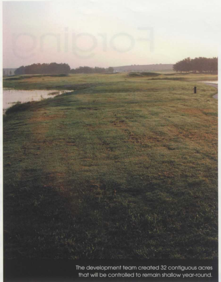
The development team created 32 contiguous acres that will be controlled to remain shallow year-round.