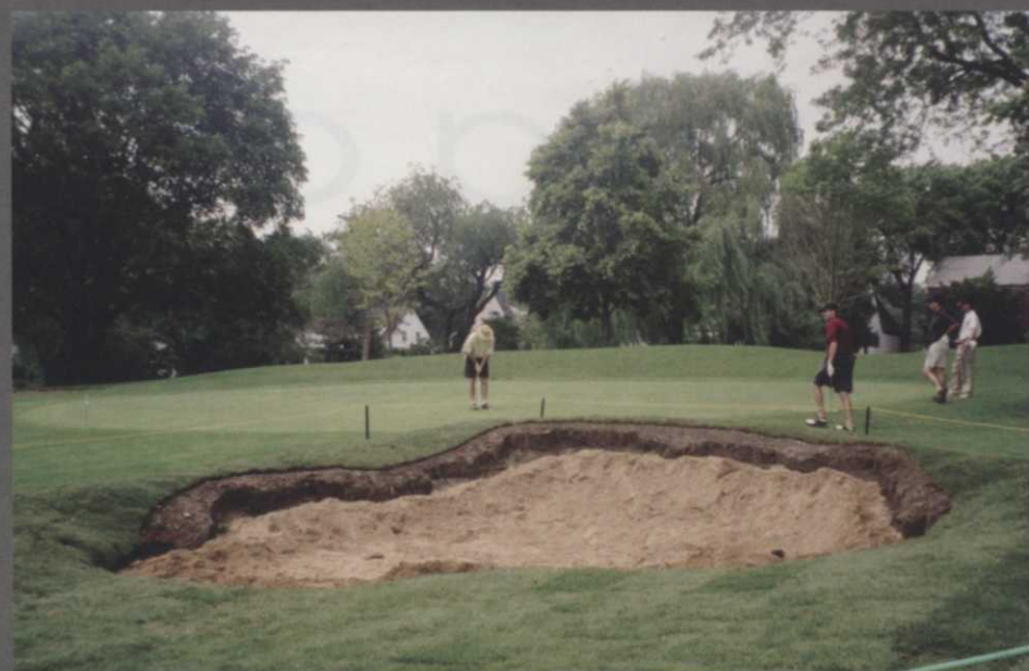
Geneva Golf Club is undergoing a $1.8-million capital improvement project that includes bunker and tee renovation.

relaxed and aren't so quick on the trigger to fire someone at the sight of a problem on the golf course."