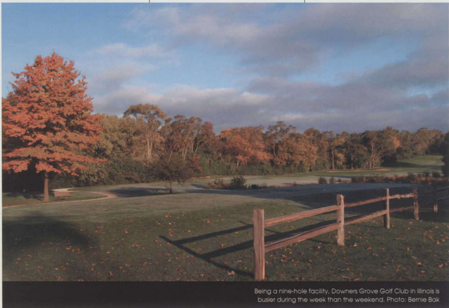
Being a nine-hole facility, Downers Grove Golf Club in Illinois is busier during the week than the weekend.

"Being private is more comforting," he says. "The best benefit of being a private course is control over the rules and being able to educate members better and teach proper etiquette. People in this area are more