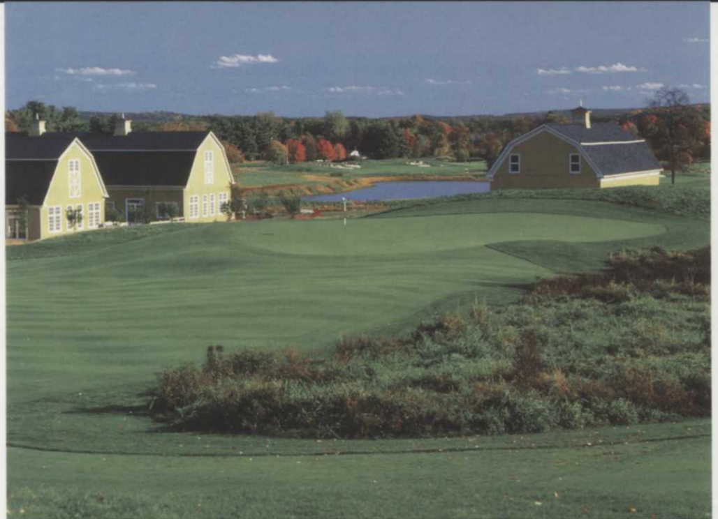
Jonathan Burke, superintendent at The Ranch Golf Club, encourages weevil in some areas because they can help keep Poa annua out of areas.

"We're treating almost year-round for some weeds," Lowe says. "We might do three or four applications to attack Poa annua and goosegrass in the pre-emergent stages. If it breaks out, then you attack it as needed. The Poa annua seeds can sit there dormant for up to 15 years ready to go. It all goes back to the budget of the club, and some clubs have members that have higher standards for their course than others."