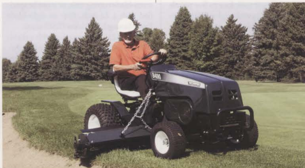
Designed with a low center of gravity and a heavy-duty front end, National Mower's 8400 hydrostatic triplex mower is designed to tackle the most difficult slopes, bands and edges.

The 8400 includes power steering for extra control while trimming difficult areas or negotiating tight corners. The mower is powered by a 16-hp Briggs & Stratton Vanguard engine and has an 84-inch width of cut that covers 3.5 acres per hour. GCN