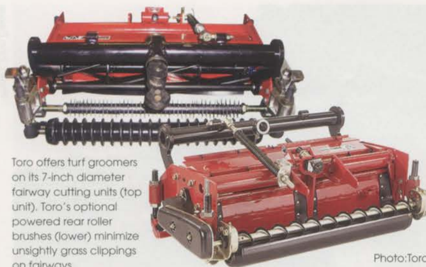
Toro offers turf groomers on its 7-inch diameter fairway cutting units (top unit). Toro's optional powered rear roller brushes (lower) minimize unsightly grass clippings on fairways.