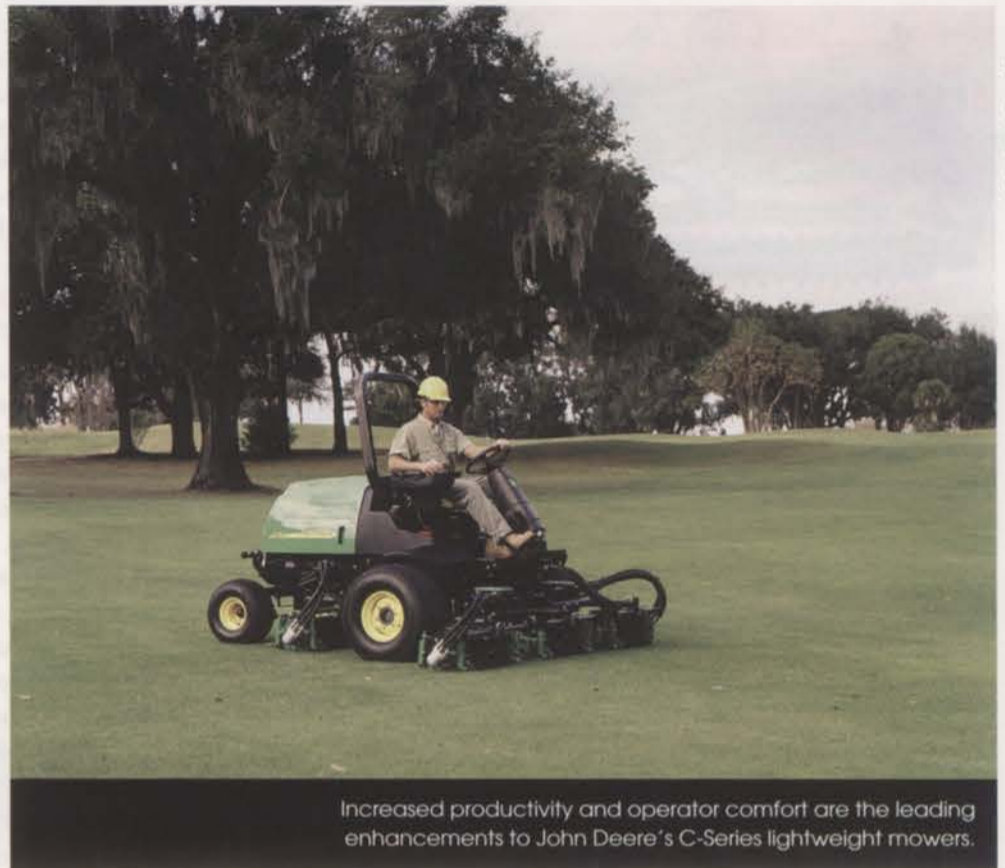
Increased productivity and operator comfort are the leading enhancements to John Deere's C-Series lightweight mowers.

• Both models have an 18-gallon fuel capacity for all-day operation.