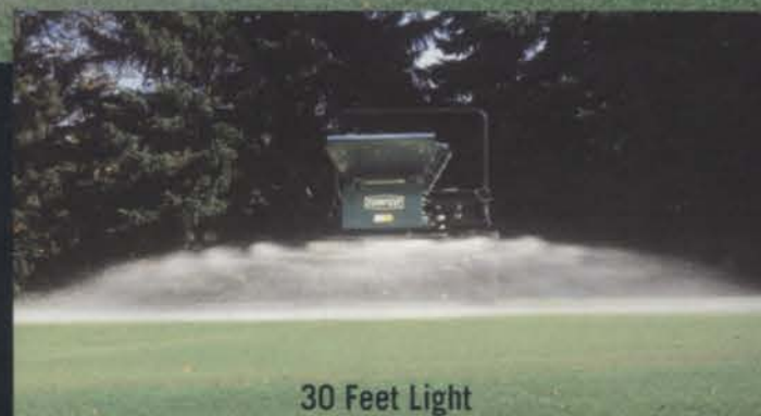
30 Feet Light