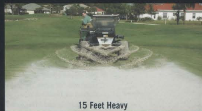
15 Feet Heavy