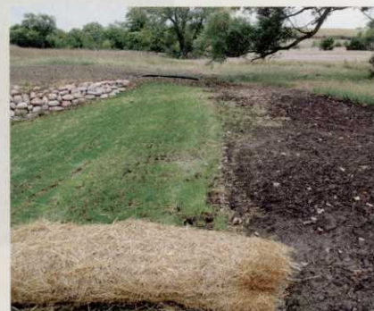
Figure 2 (Above): Spring 2013 cover of turf seeded September of 2013 in the foreground compared to turf seeded in August of 2013 in the background. Figure 3 (Top Right): May 2013 picture of creeping bentgrass seeded very early spring 2013, covered with a seed cover on the right and uncovered on the left. Figure 4 (Bottom Right): Early September 2013 seeding after three weeks of covering with an erosion blanket on the left, uncovered on the right

be through desiccation in dry windy areas, crown hydration in poorly drained areas, or direct low-temperature kill with dramatic temperature drops to extreme cold in the fall or winter (like last year's early October freeze in Figure 2).