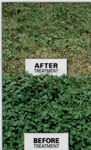
As shown in this before and after treatment photo, wild violet was eliminated from the treated area after 14 days.

One product that includes this formulation and provides a precision performance tool for turf managers is T-Zone™ Broadleaf Herbicide for Tough Weeds. Even hard-to-control weeds show visible injury within a few hours, and weed death can occur within 10-14 days.