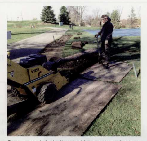
Corrugated drain lines with pea gravel were installed to move water from the tee surface.

topdress and fertilize the tees during a cool down in August to speed recovery. This decision would be fatal to some tees as the cool down didn't last and the immature tees were covered in sand and overstimulated.