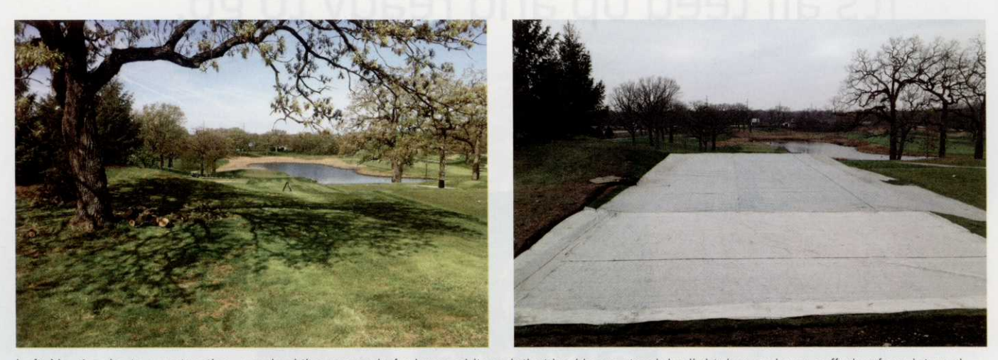
Left: No. 4, prior to construction, required the removal of a large white oak that had been struck by lightning and was suffering from internal rot. Right: The completed tee box on No. 4, note how much the area opened up after the removal of the large oak.

While the health of the grass on the tee boxes saw improvement through fall, this would only be the beginning of what issues really needed to be addressed. We made the decision to fix some of the ongoing issues that had plagued our tees.