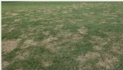
Symptoms of SDS are fairly diagnostic – patches from 6 inches up to 18 inches, or even several feet in diameter are present at spring green-up.

ies with improved cold tolerance are more resistant to SDS. Guymon, Midlawn, Midfield, Midiron, Yukon, Mirage and Sundevil have been shown to have improved resistance to SDS, whereas Arizona Common, Cheyenne, Jackpot, NuMex Sahara, Oasis, Poco Verde, Primavera, Princess, Sonesta, Shanghai, Tifton 10, Tifway, Tifgreen, Tropica, Vamont and Sunturf are all susceptible to SDS.