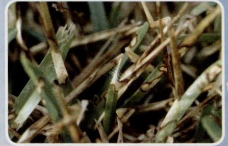
Dollar spot is easily identifiable because of its small, tan circular patches.

"I want to stress that just because the fun-