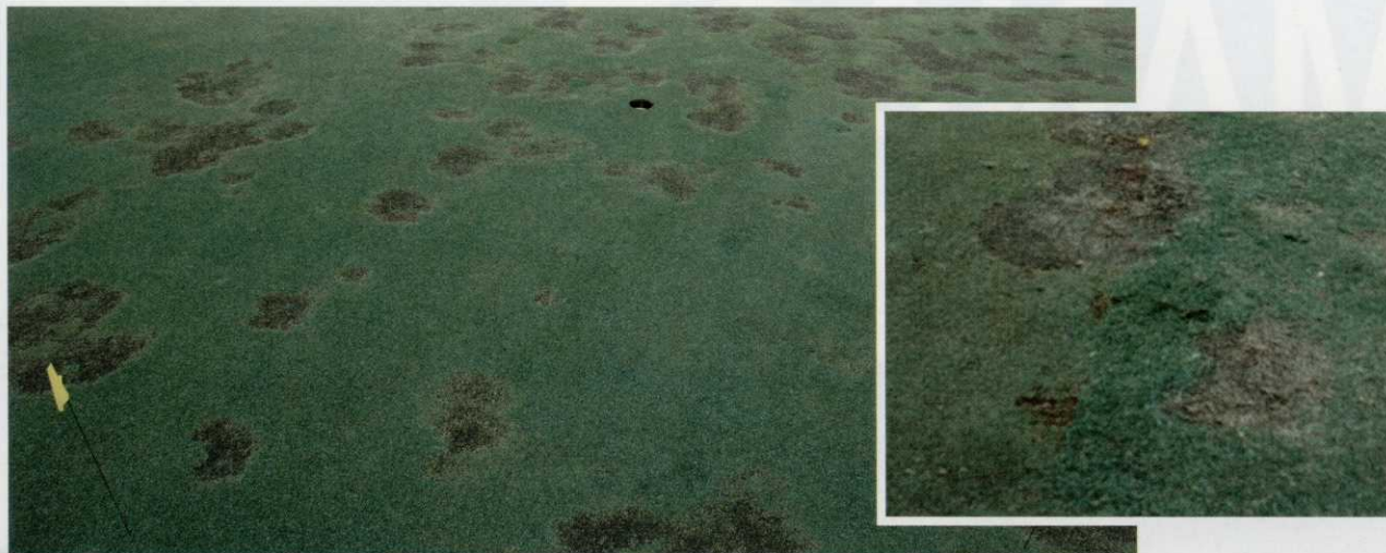
Spring dead spot is most common in the transition zone where Bermudagrass is grown and subjected to periods of cold temperatures that induce plant dormancy.

ments where Bermudagrass tends to go semi- to completely dormant, Martin says. In areas where winters are cold enough for Bermuda to go completely dormant, SDS tends to be more severe than in climates with warmer winters.