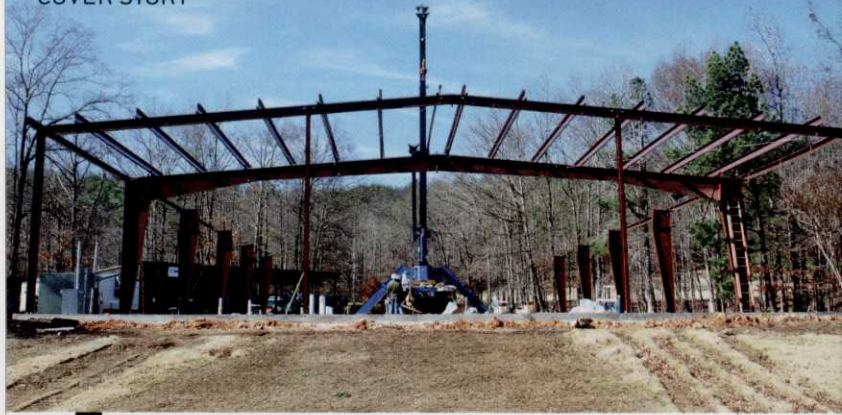
The frame of the new maintenance facility as it was under construction.