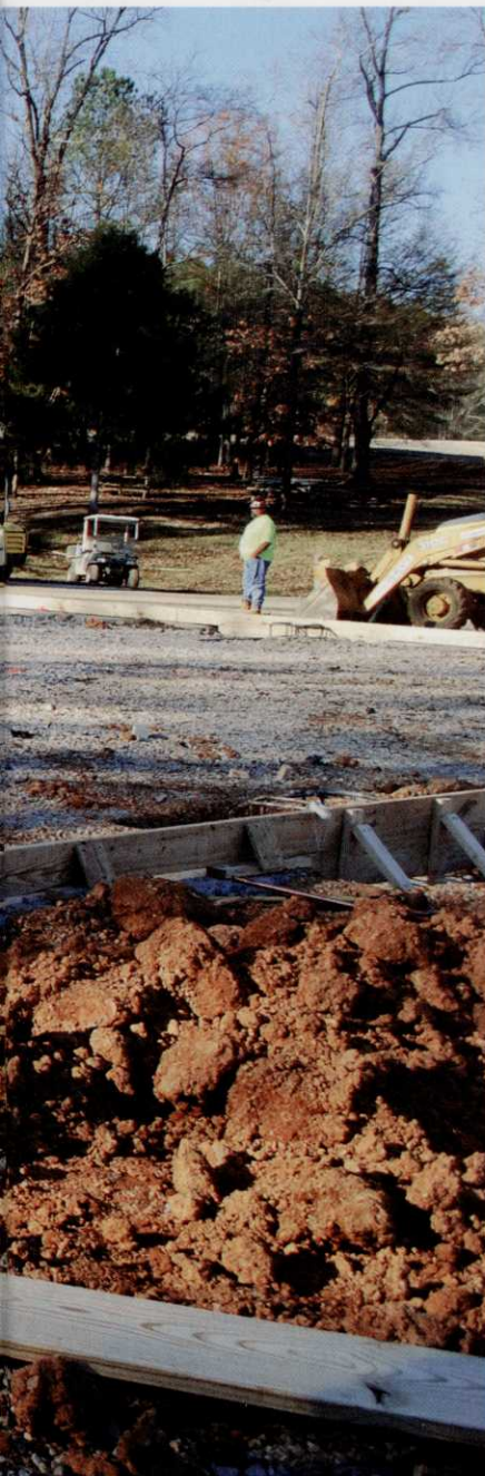
Construction of the new maintenance facility at FarmLinks Golf Club at Pursell Farms in Sylacauga, Ala.