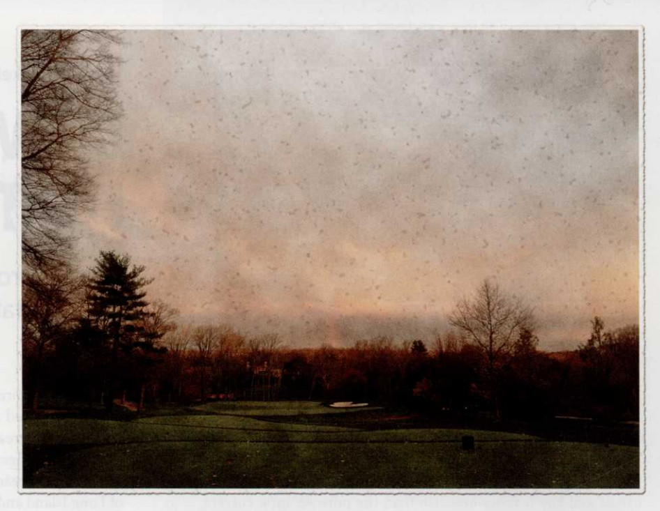
A view of the sky from the 11th tee at TCP Jasna Polana following Superstorm Sandy.

"If you look at damage to places twenty miles north of us, they really had sustained winds. Our damage was limited to flooding,