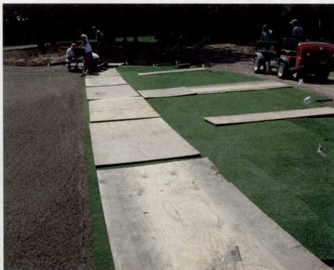
Boards put down for sod replacement help protect the turf.

and then choose a bentgrass that will perform well under the super's existing cultural practices and performance standards. That may not always mean the latest and greatest bentgrass varieties, though we always strive to maximize disease-resistance and drought tolerance.