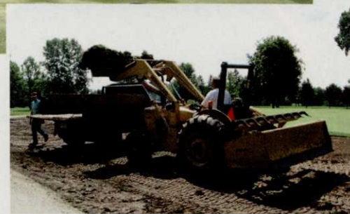
Greens renovation, including the hauling off of rough sod on the course.

The best example of this dynamic is greens renovation. Ten years ago, we in the golf industry embraced greens renovation almost as a matter of course. When greens failed to meet expectations, we often rebuilt them because a) there was plenty of money around, b) we had to keep up with the Joneses, especially the new Joneses on the block, and c) renovation was simply something superintendents wanted, and architects delivered.