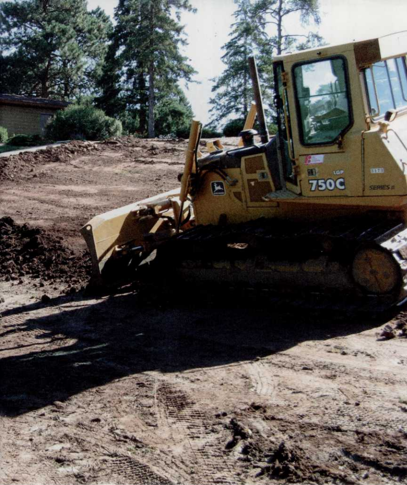
The stripping of the existing topsoil. Inset: A pile of existing mix salvage to be used later on.

sand shouldn't work but it does, where fine sand doesn't work – in situations where you'd have sworn it would.