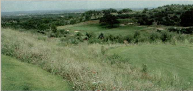
Buffalograss provides nice visual definition surrounding bermudagrass tees and goes well with naturalized areas at Horseshoe Bay Resort in Texas. Water use for tee complexes is reduced because buffalograss surrounds are not irrigated; only the bermudagrass teeing surfaces are included in the automatic irrigation design.

other benefit of this species, and it thrives in this dry and difficult environment. As evident during the lack of rainfall in recent years, buffalograss has impressive drought resistance and can maintain its color well into a drought. And if it eventually does go into drought-induced dormancy and turns off-color, it resumes its color and growth quickly after receiving small amounts of rainfall or irrigation.