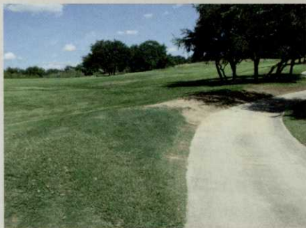
Buffalograss possesses good tolerance to traffic, including carts, but damage can still occur where carts do not remain on paths.

Buffalograss has shown relatively good shade tolerance at Summit Rock, but its weakness is traffic tolerance, both foot and cart. This should be a consideration when identifying areas for establishment.