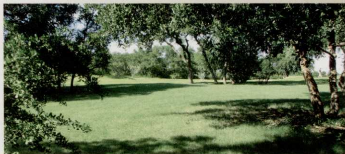
While buffalograss does best in full sun, it is performing well in shaded areas of the deep rough at Briggs Ranch Golf Club.