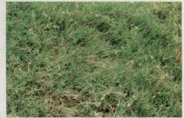
At higher mowing heights, the distinctive buffalograss seedhead will be visible, but it has little, if any, impact on playability.

highly regarded in the golfing community. Not so! The USGA was proud to award the 2012 Women's Mid-Amateur Championship to Briggs Ranch Golf Club. This, one of the USGA's 10 national amateur championships, took place in October 2012, while still in the midst of an extreme drought. Briggs Ranch Golf Club was up to the chal-