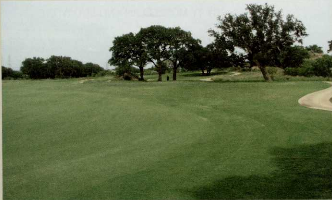
Buffalograss works well as a low-maintenance rough, in this case around a zoysiagrass fairway at Briggs Ranch Golf Club near San Antonio, Texas.

buffalograss and are better suited for use on golf courses. If you haven't observed firsthand recent releases of buffalograss varieties, then you almost certainly have a misconception (and likely bias)