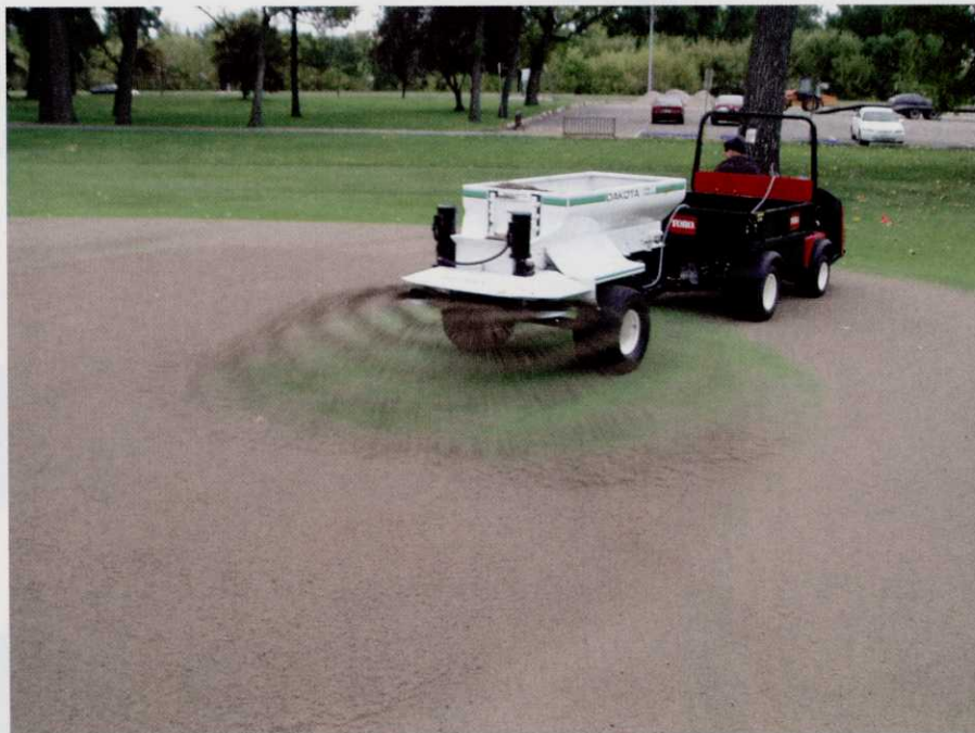
Superintendents who can't keep their greens wet can change the sand size, but be aware that choosing too fine a sand can create a whole new set of problems.

At a previous course Koops worked at, the