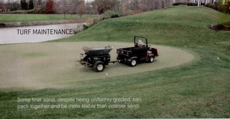
Some finer sand, despite being uniformly graded, can pack together and be more stable than coarser sand.